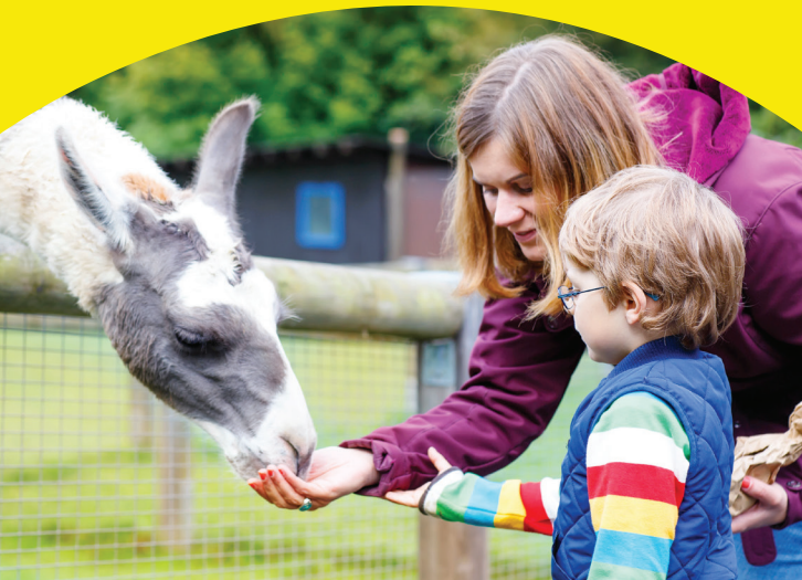
Events for the whole family